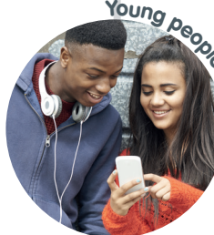
Young people aged 11-27