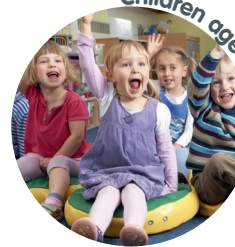
Children aged 0-11