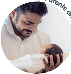
Parents and carers